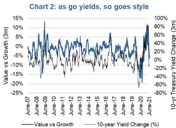
Chart 2 is the 3-month percentage change in the 10-year Treasury yield and the 3-month relative performance of value vs growth. It is not a perfect relationship but the correlation is material and significant. So even though yields have come back down a bit, if you believe yields will rise in the coming months or quarters, value remains the better style tilt.

There is also no denying the valuation gap remains elevated to the extreme between value and growth. Currently, growth is trading at 27.3x and value at 17.1x forward earnings. To be fair, index